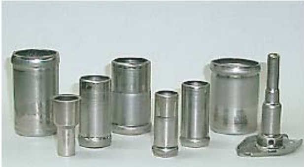
SUS304, SUS316, SUS430, etc.